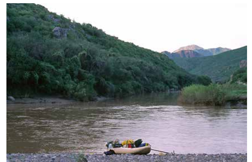
Left, from top: Dramatic canyon walls along the Río Aros.