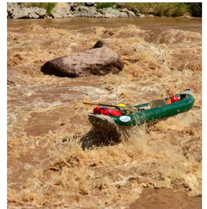
Right: One morning the river rose so quickly (after an overnight rain in a distant part of the watershed) that our camp was inundated and our inflatable kayak navigated the next rapids without benefit of a captain.