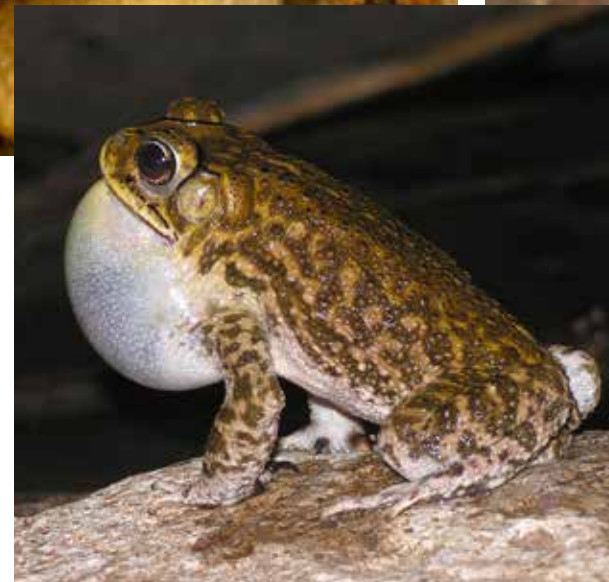
Clockwise from opposite page top: Black-necked garter snake (Thamnophis cyrtopsis) in its aquatic element. Gila monster (Heloderma suspectum), one of two venomous lizards in North America (the other is the beaded lizard, also found in Mexico). Singing male Mazatlán toad (Ollotis mazatlanensis). Sonoran whipsnake (Coluber bilineatus) basking on a warm rock